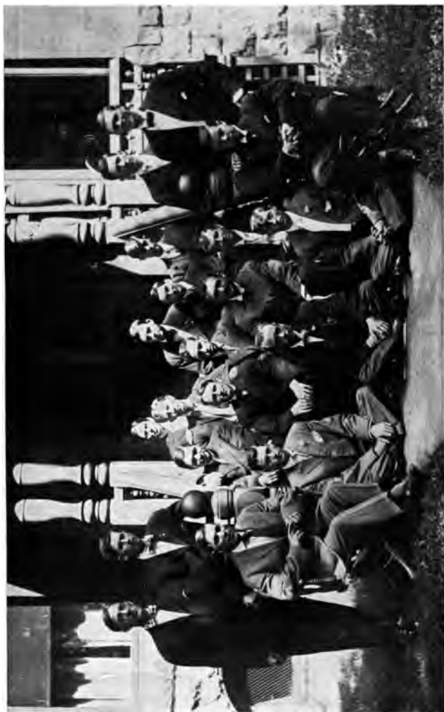
THE GUILD First Baptist Church, Detroit, Mich.